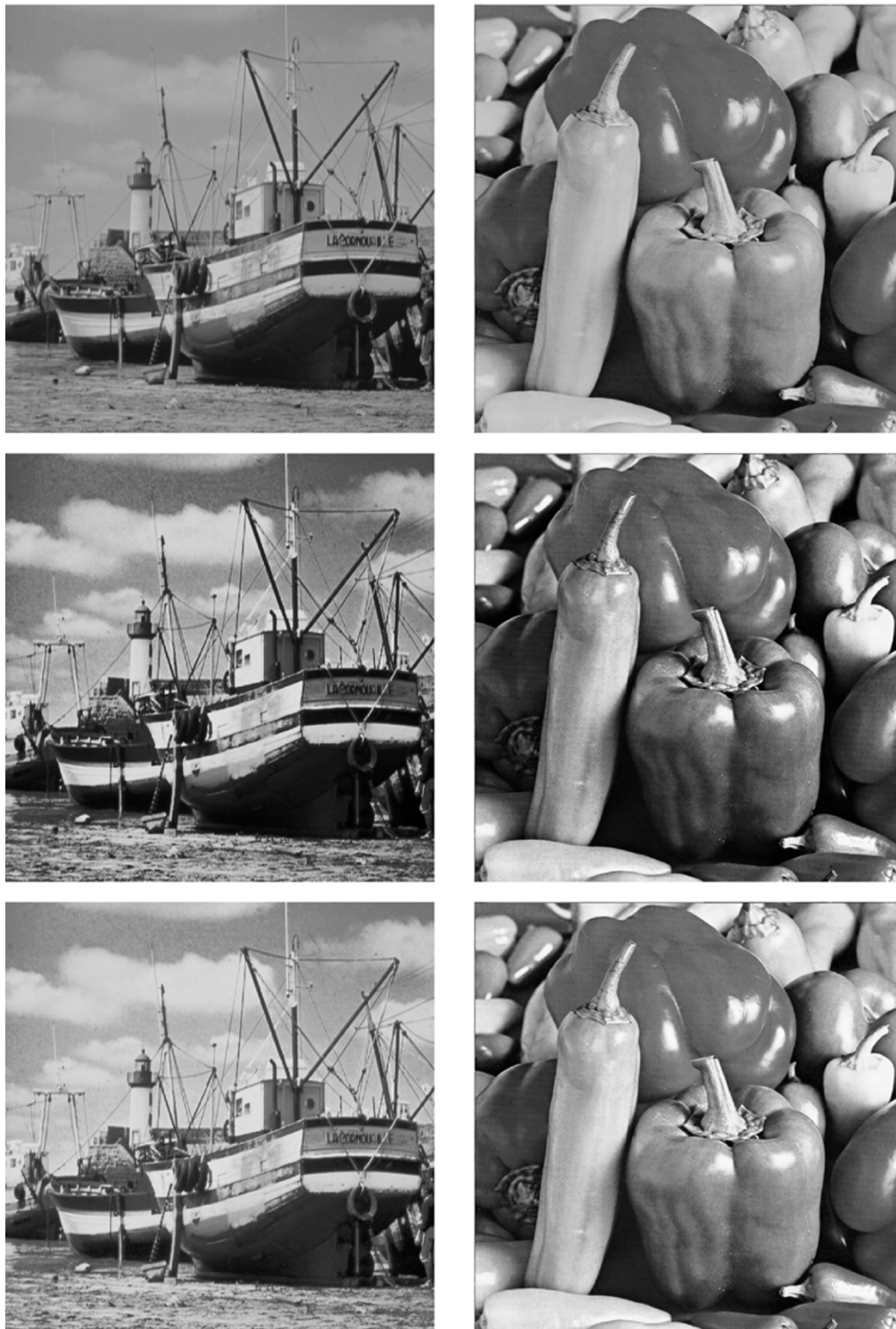
Fig. 5. Color images exact histogram specification: (top) original, (middle) logarithmic, and (bottom) linear.

to process only the luminance component . Such color spaces are so-called television color spaces ( YUV , YIQ , YC_aC_b ), perceptual color spaces (HSI, CIELAB), etc., [17]. Let HSI (hue, saturation, intensity) be such a color space. Since images are generally represented in RGB color space, exact histogram specification is addressed by: i) conversion from RGB to the HSI, ii) ordering, iii) exact histogram specification performed on the I component (like for graylevel images) and finally, and