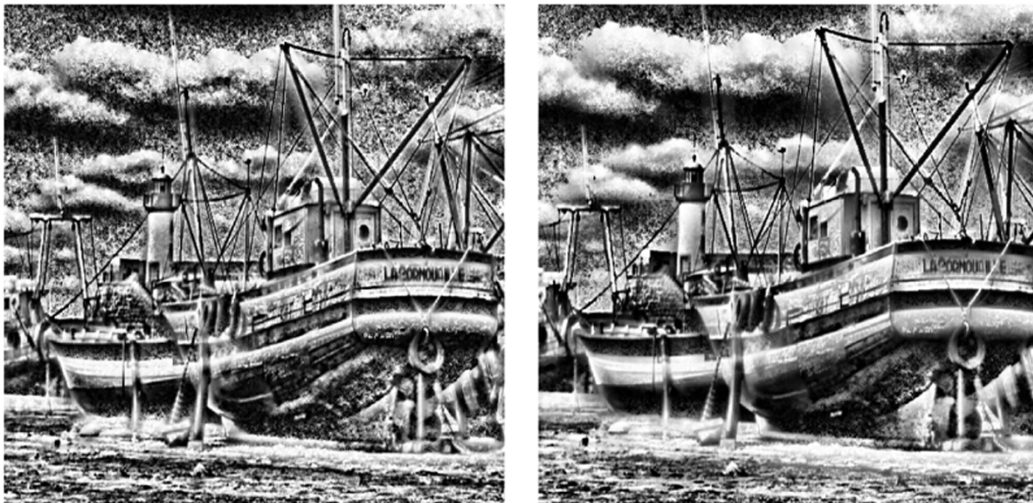
Fig. 4. Local histogram equalization: (left) 16 \times 16 window; (right) 32 \times 32 window.