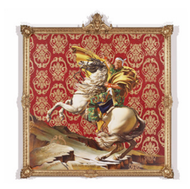
Kehinde Wiley, Napoleon Leading the Army over the Alps, 2005